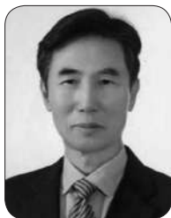
대한신경외과학회 회장 김수한